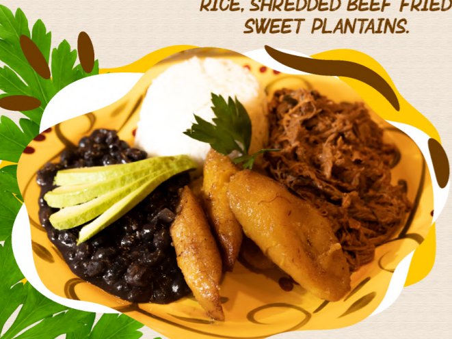
PLATE WITH BLACK BEANS WHITE RICE, SHREDDED BEEF FRIED SWEET PLANTAINS.